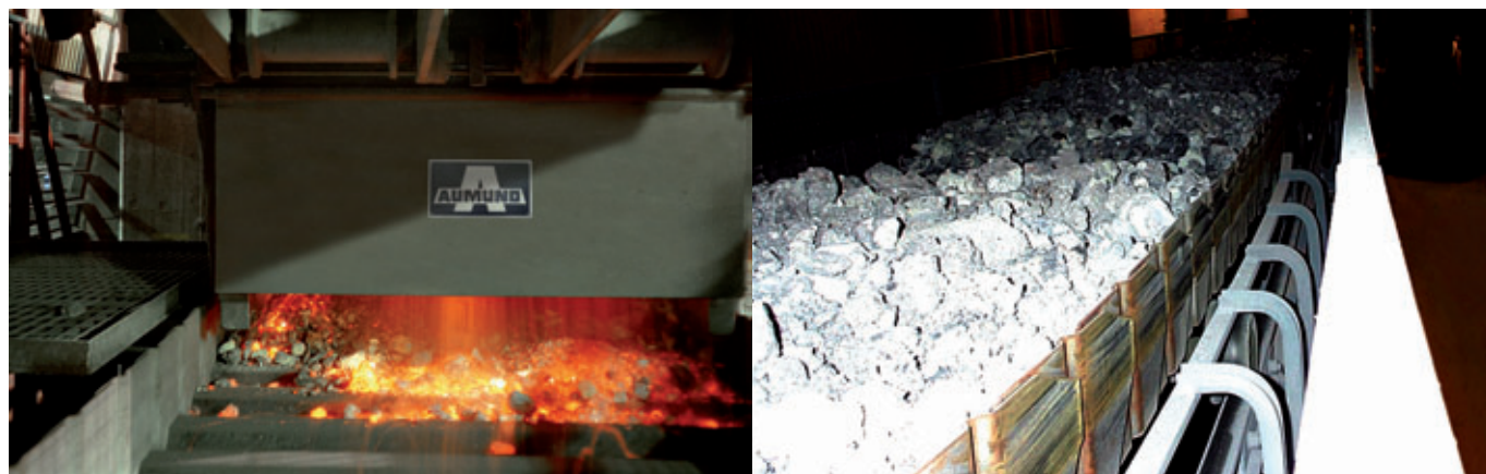
Bath material cooled down from 850 °C to 100 °C