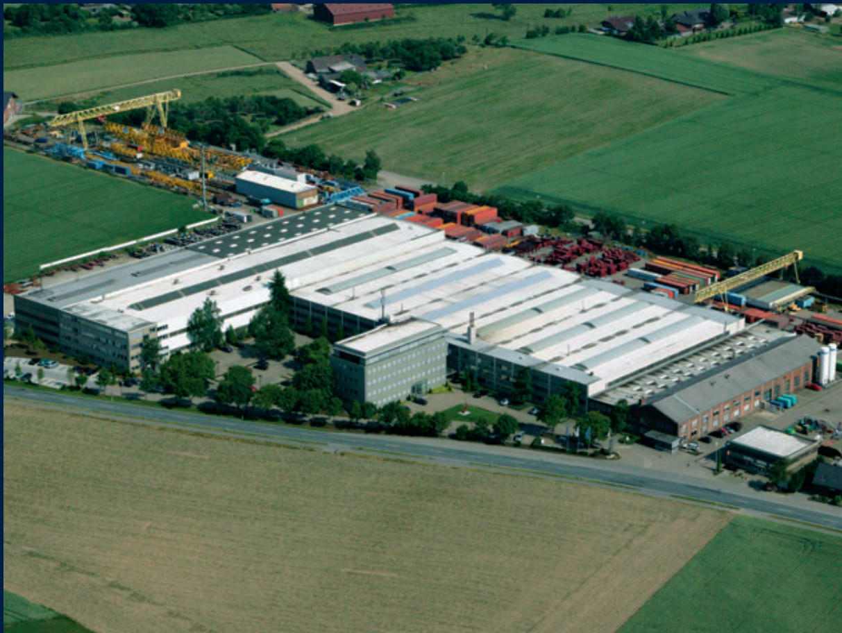
AUMUND Headquarters in Rheinberg, Germany