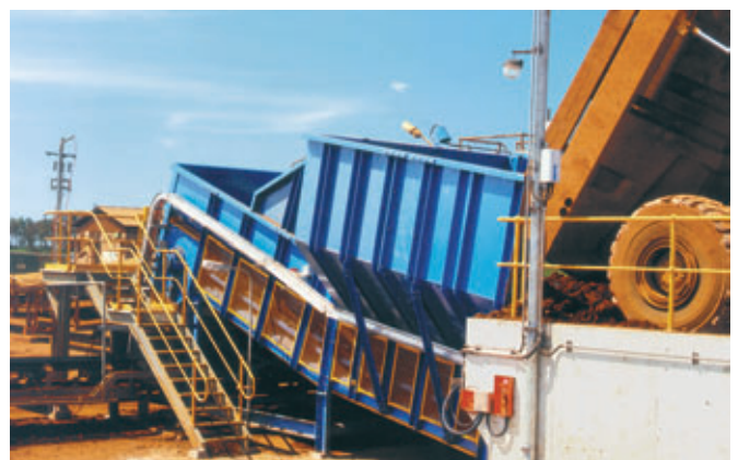
SAMSON™ Surface Feeder for red mud