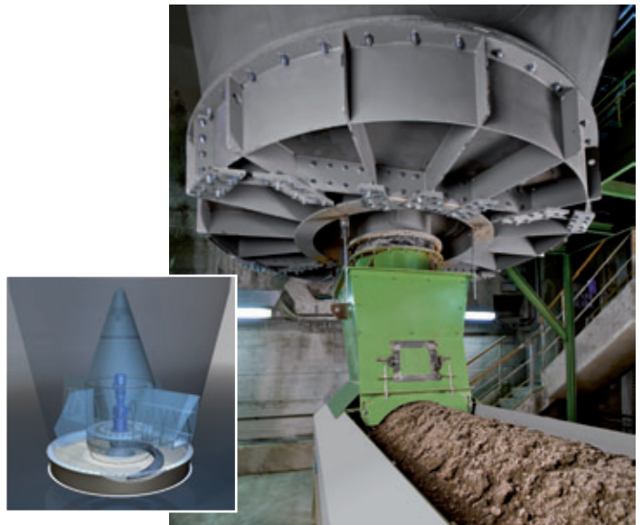
CENTREX™ Automated bauxite discharge