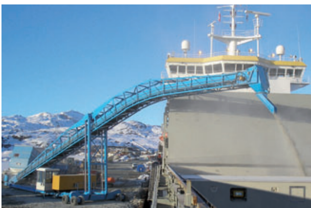
Shiploader for alumina and bauxite handling