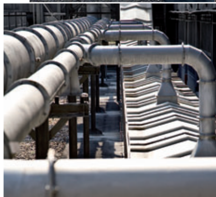
Cooling conveyor with dedusting main pipe