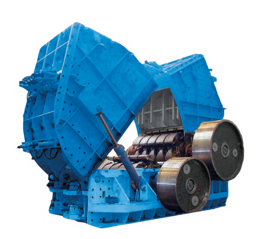
Compound Crusher HPC